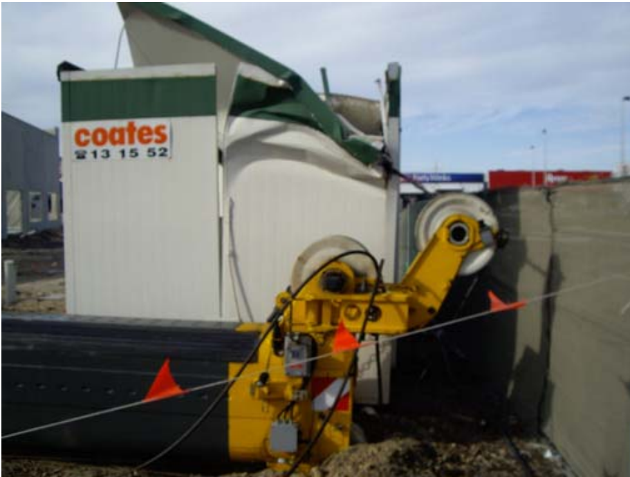
Crane boom alongside toilet block.