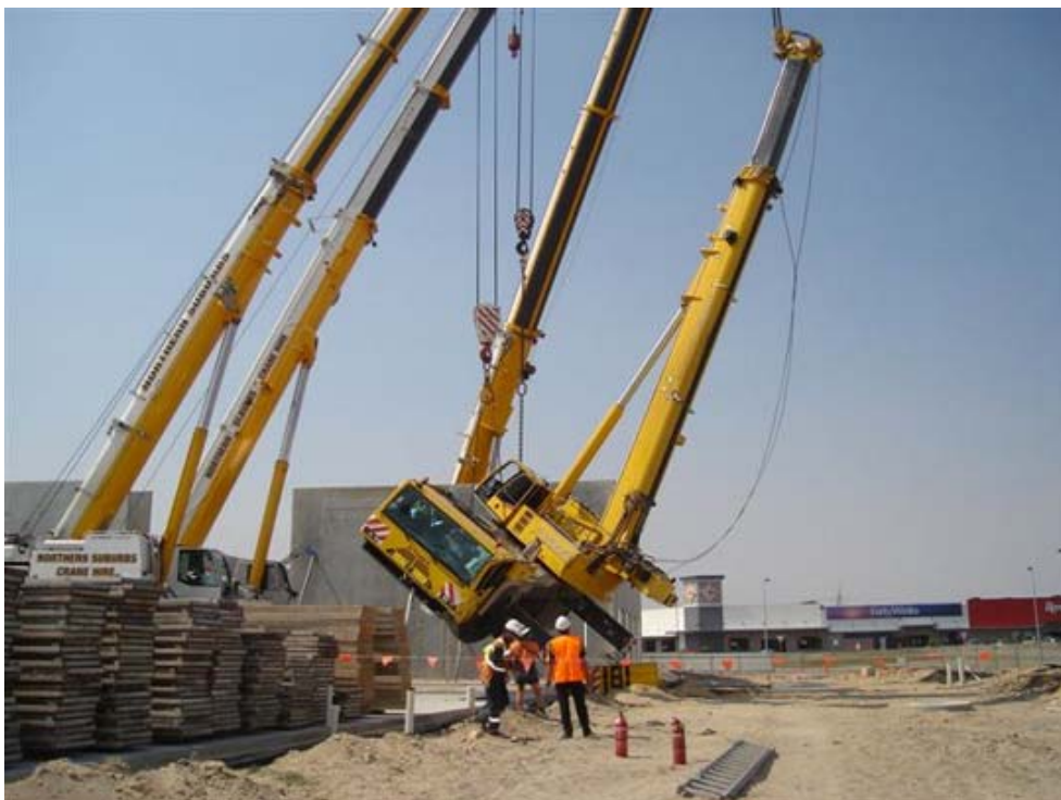
Cranes 2 & 3 take weight and lift carrier.