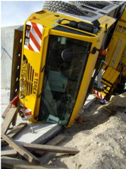
Crane carrier driver cabin.