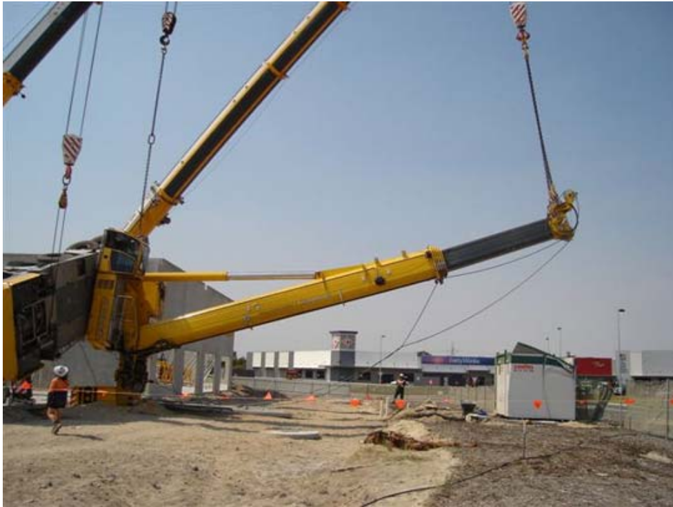
Crane 1 takes weight of boom section.