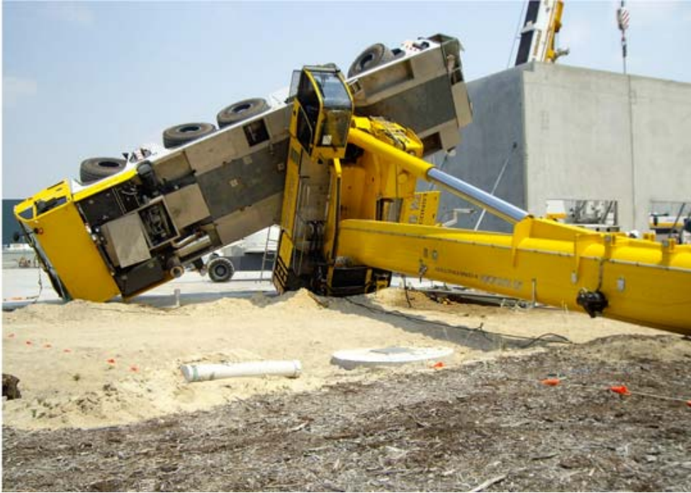
View of Demag crane prior to recovery.