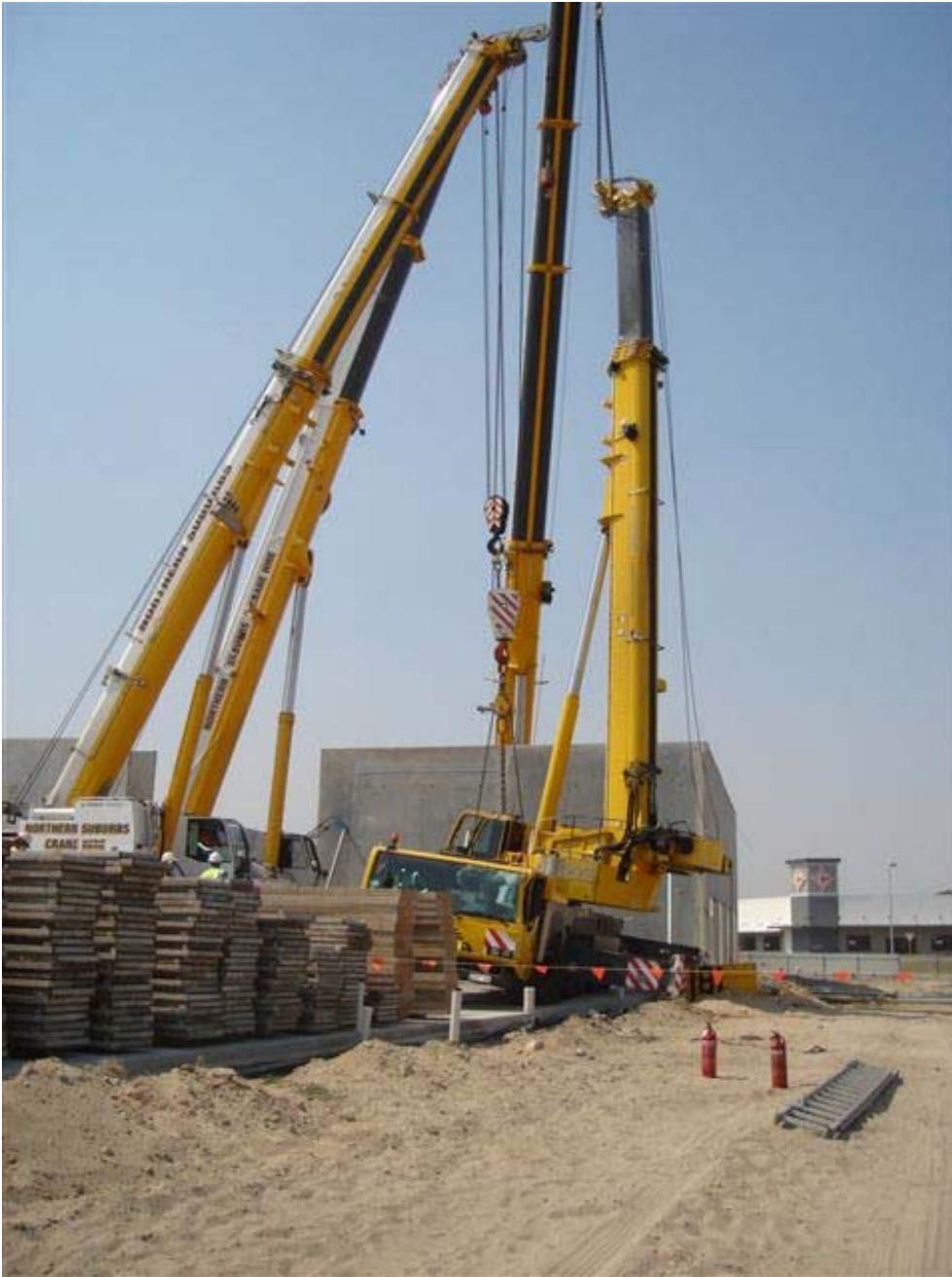
Crane is rotated back on to wheels.