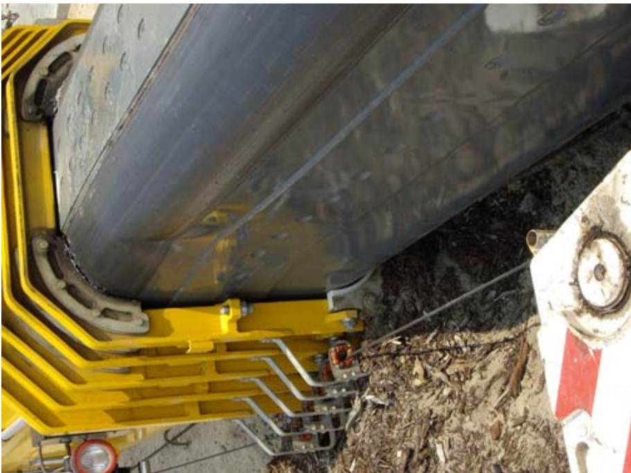
View showing damage to boom section.