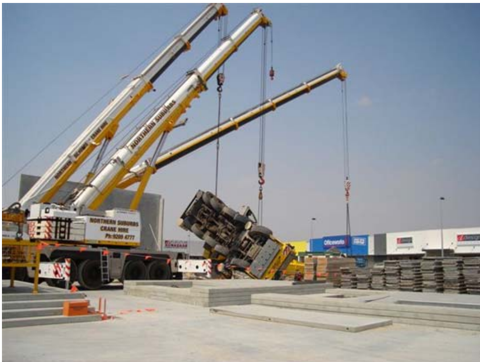
Damaged crane is rigged up for recovery lift.