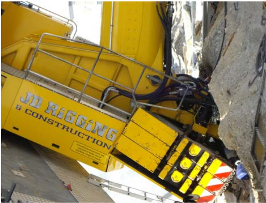
28 tonne detachable counterweights.