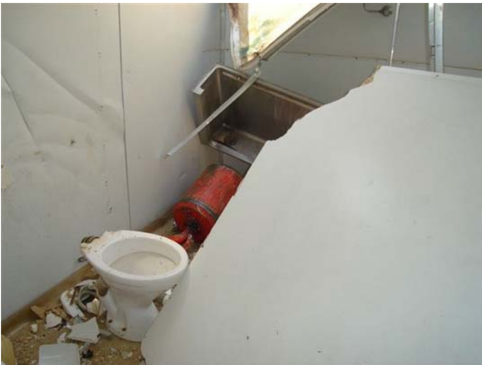
Hook and wire rope that sliced through toilet block.