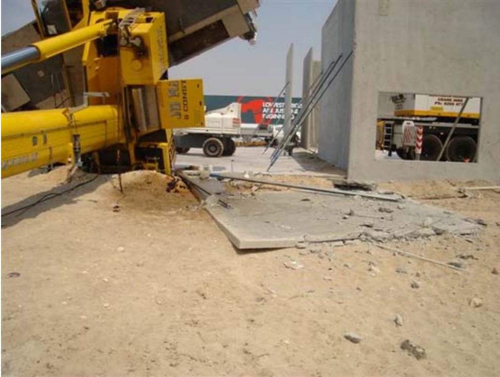
Tilt-up panel that fell when struck by crane carrier.